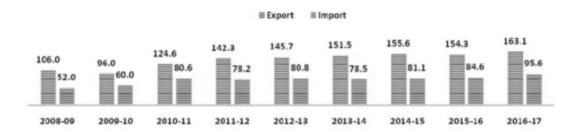
Chart 3: India's Services Trade